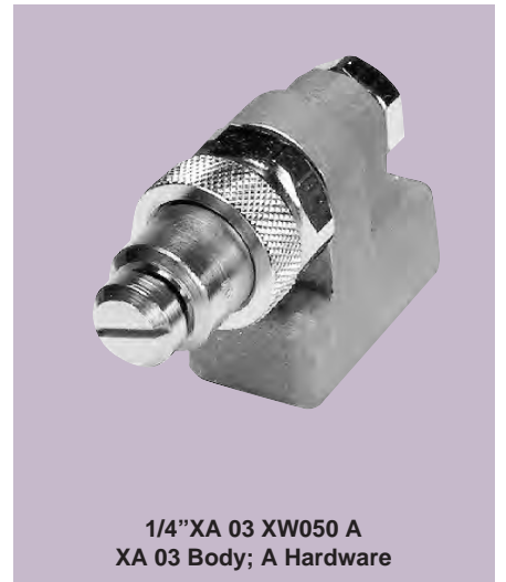
1/4"XA 03 XW050 A XA 03 Body; A Hardware