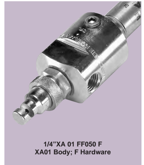
1/4"XA 01 FF050 F XA01 Body; F Hardware