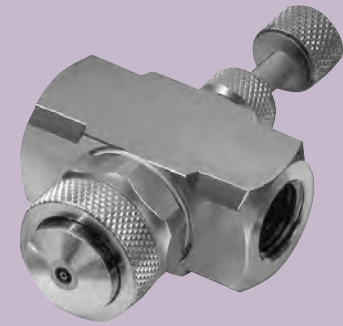
1/4"XA SR 200 B XA 00 Body; B Hardware

Dimensions are approximate. Check with BETE for critical dimension applications.