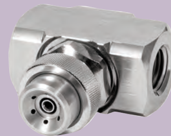
1/4" XAER850A XA 00 Body; A Hardware

Dimensions are approximate. Check with BETE for critical dimension applications.