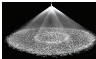
Full Cone 120° (W)