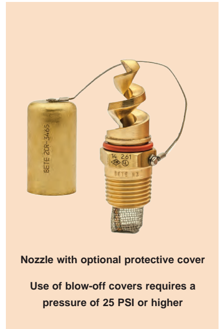
Nozzle with optional protective cover

Use of blow-off covers requires a pressure of 25 PSI or higher