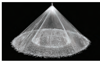
Full Cone 90°

Use of blow-off covers requires a pressure of 25 PSI or higher