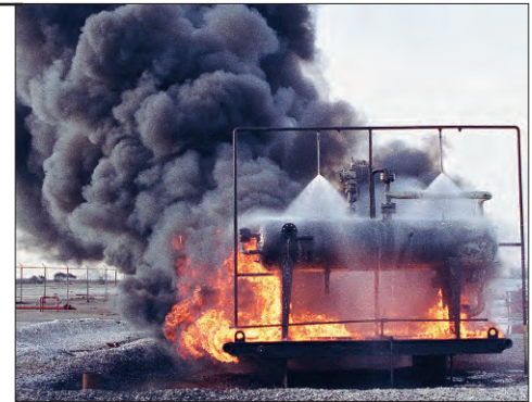
N6 nozzles protect a propane storage tank from fire and explosion.

TF24-150° also available in Factory Mutual approved model (see page 20)