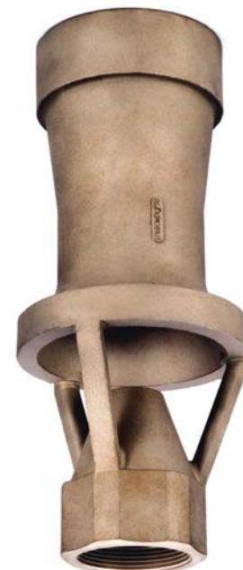
BETE TurboMix 1500 300 gpm (1135 l/min) 40 psi (2.75 bar)