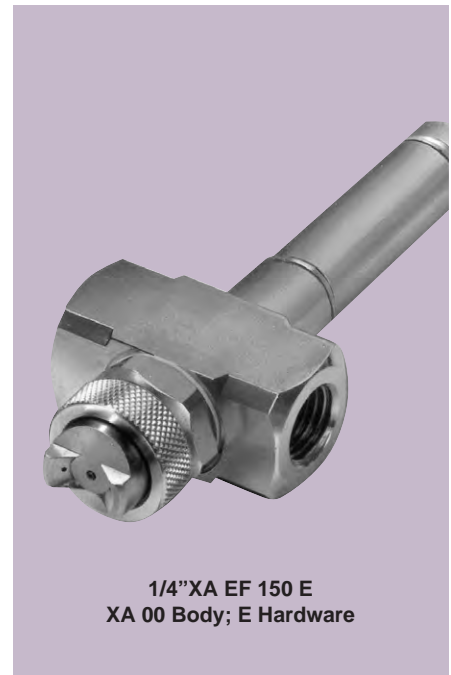
1/4" XAEF 150 E XA 00 Body; E Hardware

Dimensions are approximate. Check with BETE for critical dimension applications.