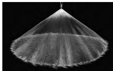
Full Cone 120°